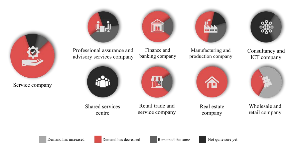
Figure 3. Change in the demand of products and services by sector.